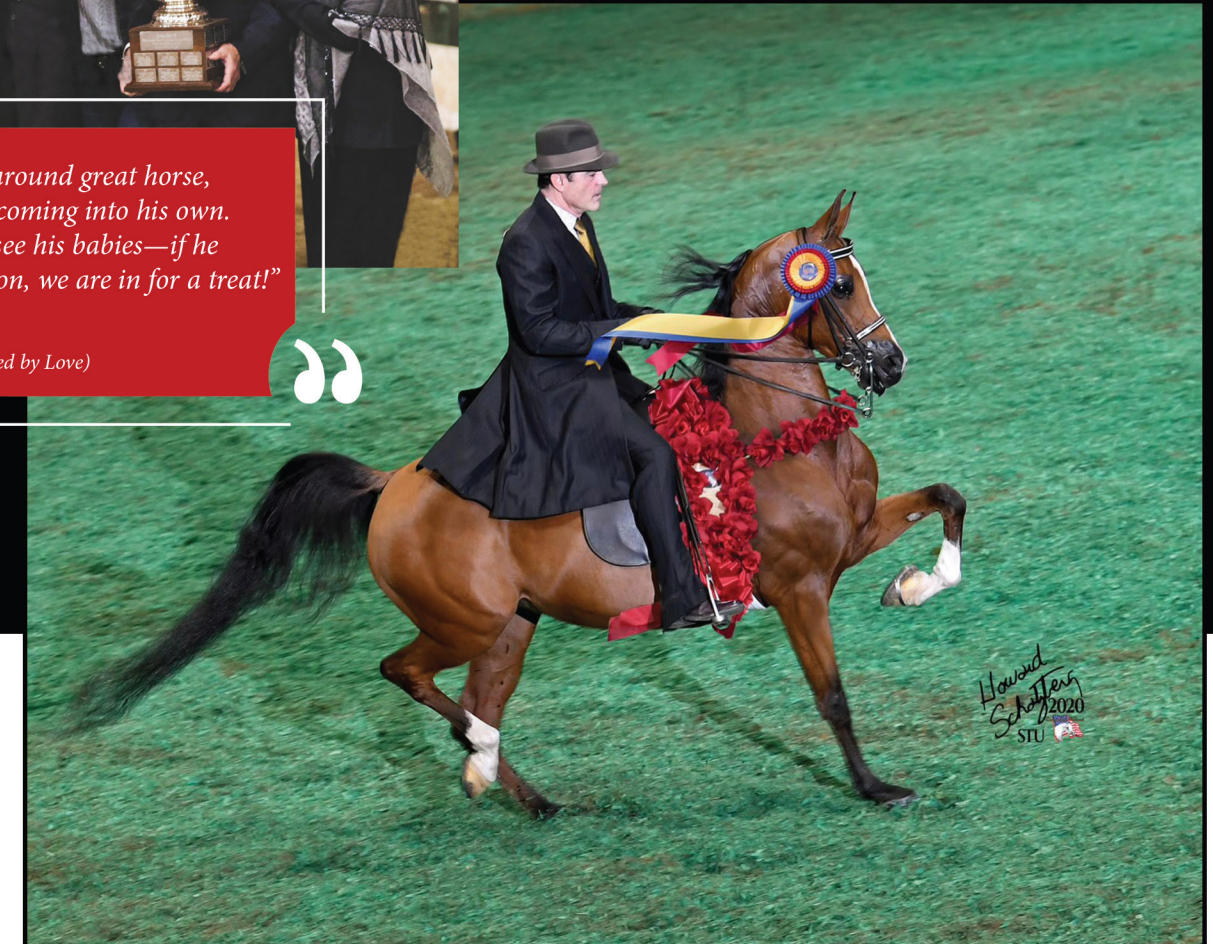
10-Time U.S. National Champion Heirs Noble Love (Afires Heir x Noble Aphroditie,) dam of Multi-National Champion Prosuaded By Love.

I think Prosuaded By Love is going to be a good example of that, and he could pass it along as a sire.”